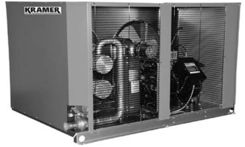
Unit is shown with optional components mounted